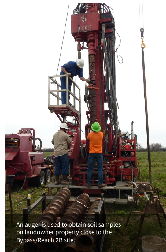
An auger is used to obtain soil samples on landowner property close to the Bypass/Reach 2B site.

This construction project will be located adjacent to Mendota, a city of approximately 11,000 with unemployment of approximately 9-percent. Based on analysis in the Environmental Impact Statement/ Environmental Impact Report for the Mendota Pool Bypass and Reach 2B project, the project is expected to directly create 100 construction jobs near Mendota, in addition to over 140 indirect jobs for the anticipated 10-year construction period.