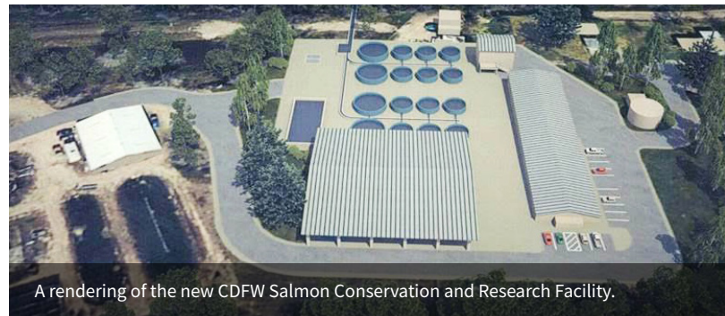
A rendering of the new CDFW Salmon Conservation and Research Facility.

As part of its contribution to the project, Reclamation is funding the $1.3 million construction of a new water supply line for the SCARF. The project will replace 350-feet of 24-inch diameter water line with 30-inch diameter water line capable of eventually moving an additional 20 cfs of water (from 35 cfs to 55 cfs) to the existing hatchery and SCARF. Water line completion is expected in spring 2017.