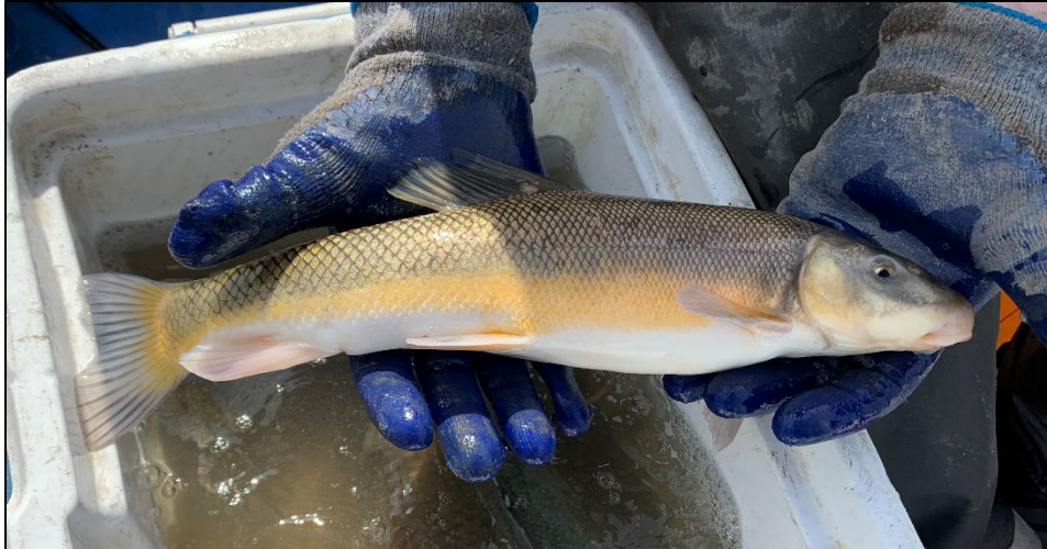
Figure A-5. Sacramento Sucker ( Catostomus occidentalis ) captured while electrofishing, Reach 5, San Joaquin river, CA.