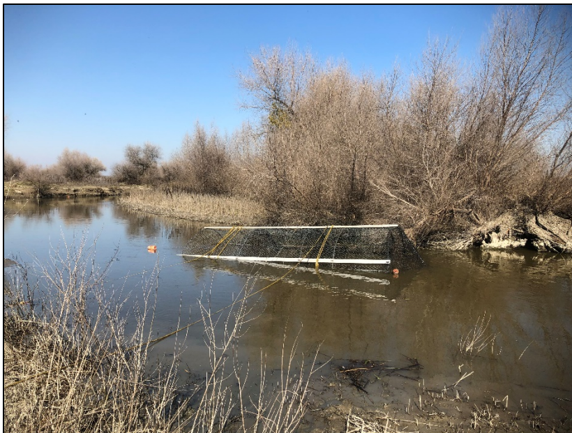
Figure A-2. Fyke trap monitoring, 2019-20 Steelhead Monitoring Plan, Mud Slough, Reach 5, San Joaquin River, CA.