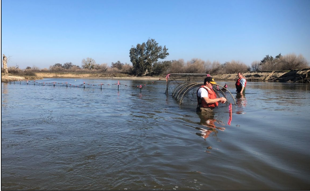
Figure 2. Deployed fyke net at Hills Ferry Barrier location, Reach 5 of the San Joaquin River Restoration Area. Note opening and v-shape of wing walls facing downstream.