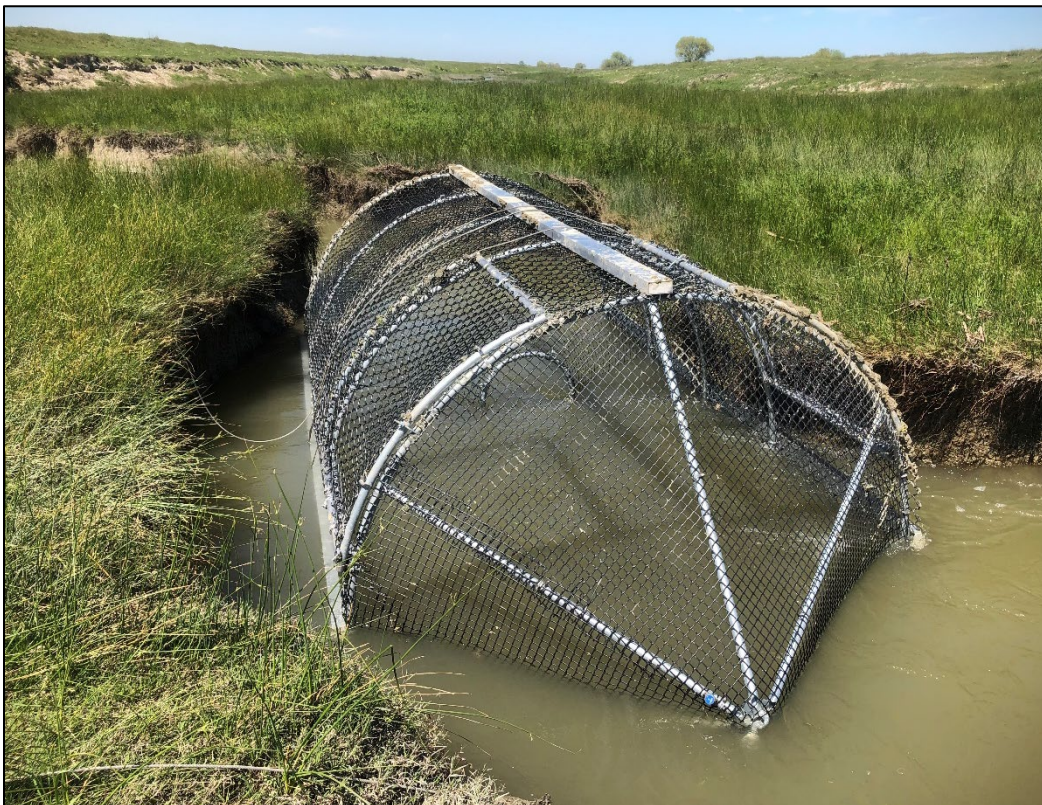
Figure 3. Fyke trap deployed in Eastside Bypass, Reach 4 of the San Joaquin River Restoration Area. Note downstream orientation of the trap opening and riverine bottleneck location.