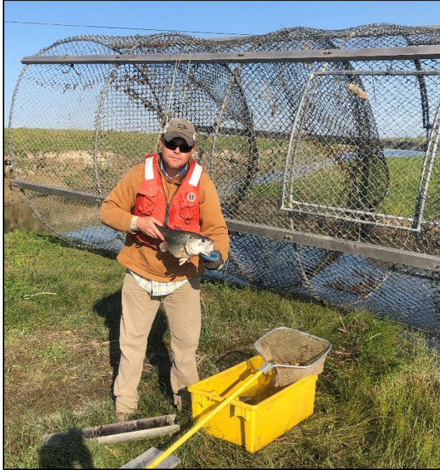
Figure A-7. Largemouth Bass ( Micropterus salmoides ) captured while fyke trapping, Eastside Bypass, Reach 4B1, San Joaquin River, CA.