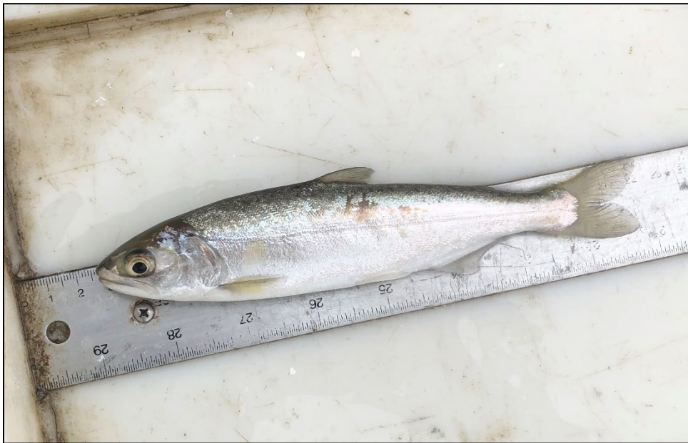
Figure A-6. Hatchery released juvenile Spring-run Chinook Salmon ( Oncorhynchus tshawytscha ) captured while electrofishing, Reach 5, San Joaquin river, CA.