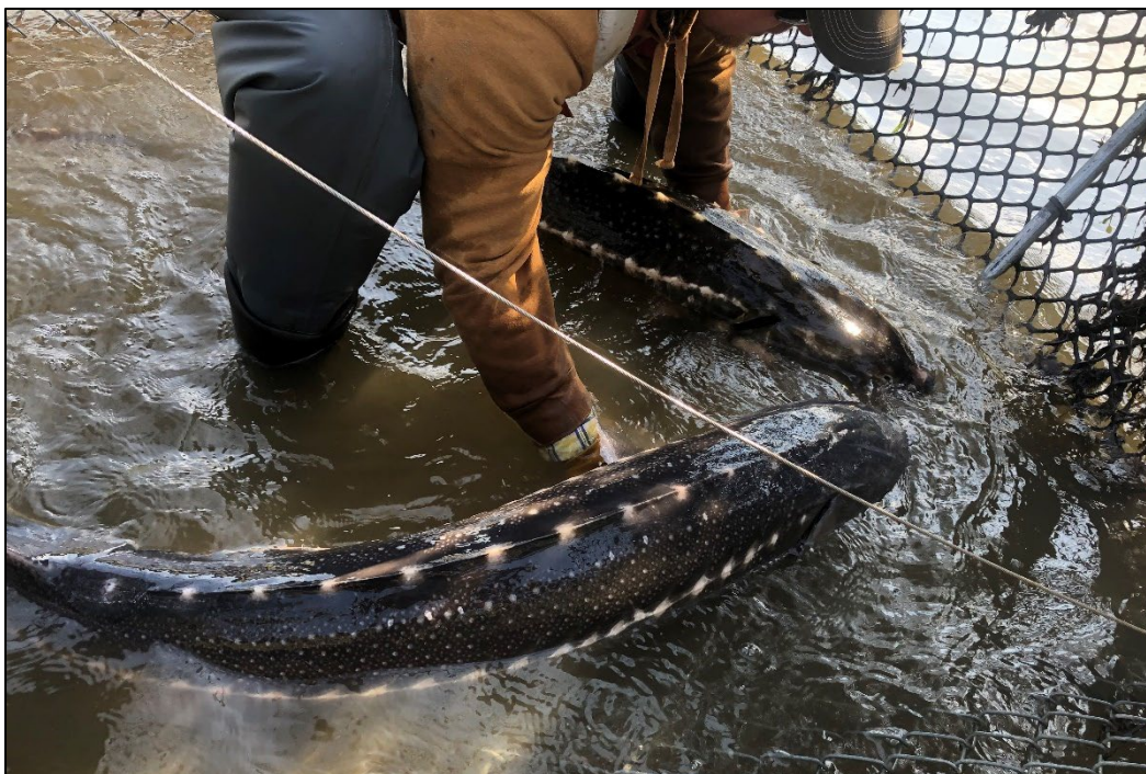
Figure 4. Reclamation Biologist with a Green Sturgeon ( Acipenser medirostris ) and a White Sturgeon ( A. transmontanus ) captured simultaneously while fyke trapping during Steelhead Monitoring Plan efforts, Reach 5, San Joaquin River, CA.

( Catostomus occidentalis , 89.9 %), juvenile Spring-run Chinook Salmon ( Oncorhynchus tshawytscha , 2.9 %), Fall-run Chinook Salmon (adult; O. tshawytscha , 1.4 %), Green Sturgeon ( Acipenser medirostris ), Sacramento Pikeminnow ( Ptychocheilus grandis ), Sacramento Splittail ( Pogonichthys macrolepidotus ), Sacramento Blackfish ( Orthodon microlepidotus ), and White Sturgeon ( A. transmontanus ). Of interest, one adult Green Sturgeon was captured twice at Hills Ferry Barrier fyke trap. Green Sturgeon are native to California and are known to be present in the Sacramento – San Joaquin River Delta, however, this is the first individual recorded within the Restoration Area (Root, Sutphin, and Burgess 2020. Draft in Press).