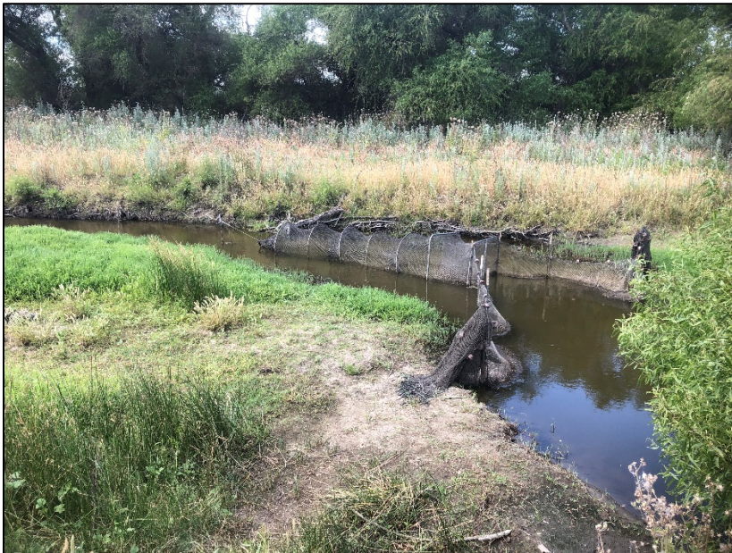
Figure A-4. Fyke netting during the 2019-20 Steelhead Monitoring Plan at Van Clief SJR. Reach 4B2, San Joaquin River, CA.