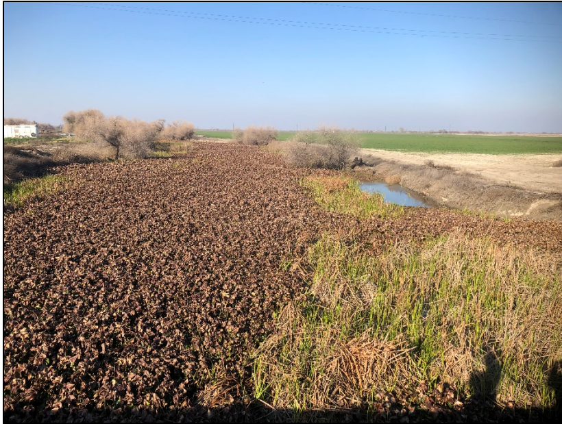
Figure A-1. Reach 4B2, Salt Slough, San Joaquin River, CA. Elevated water hyacinth restricted access, and likely fish passage, and monitoring was not completed at this location during 2019-20 Steelhead Monitoring Plan.