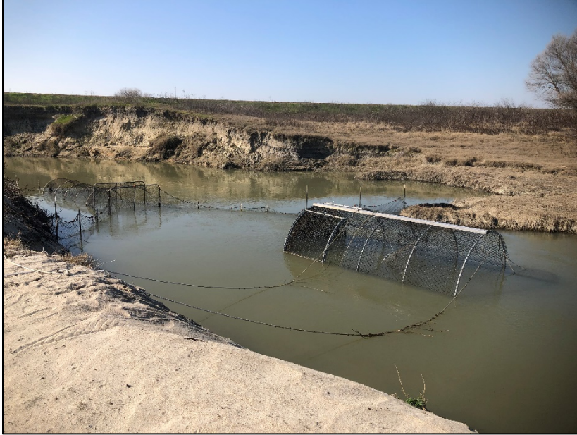
Figure A-3. Overlapping fyke trapping and netting during the 2019-20 Steelhead Monitoring Plan at Van Clief, Reach 4B2, Bear Creek, CA.