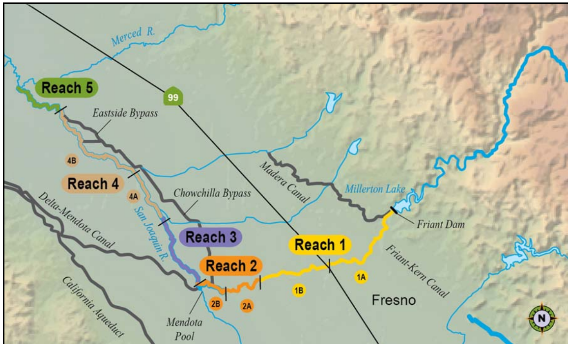
Figure 2-1 Five Main Reaches of the San Joaquin River as Identified in the Settlement

One commenter pointed out that constructing levees to support increased flows would destroy pristine habitat, and recommended that the existing flood bypass channel be used instead of Reach 4B. The comment stated that existing habitat is home to a variety of trees, bushes, and plants that have created a natural habitat for a large variety of animal species, and that in addition to vegetation, cranes, egrets, quail, hawks, and other birds roost in a designated area south of Turner Island Road.