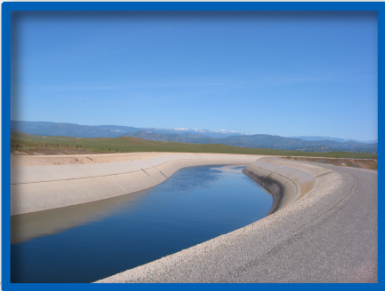
FRIANT KERN CANAL